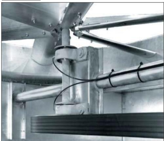
Figure 1: Belt Drive System

From an initial cost perspective, belt drive systems are the most economical, and can be reliably operated with motors up to and including 75 HP. Higher horsepower applications are typically supplied with a gear or direct drive system. Belt tension checks and fan shaft bearing lubrication are the only routine drive maintenance procedures that are required. Quarterly sheave alignment checks are also recommended. Given the low cost of belts, it is not uncommon for spare belts to be stored at a jobsite, since they are considered "wear" items. The use of variable frequency drives provide soft start capabilities, allow for excellent capacity control, and greatly extend belt life!